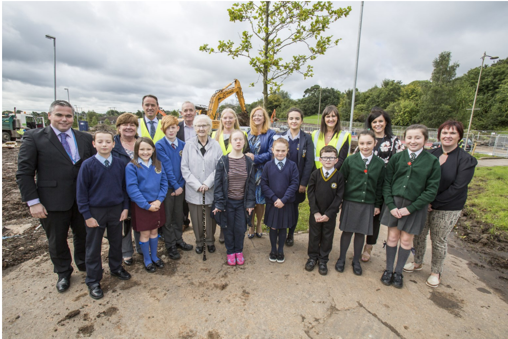
Local community representatives and pupils from local schools in Colin with members of the Urban Villages Initiative team.