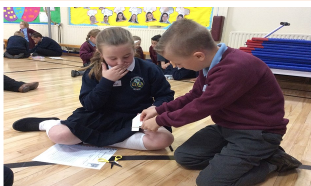
Pupils from Greystone PS & St. Joseph's PS, Antrim engaging in Shared Numeracy Activities

Partnerships have the freedom to work across the curriculum including the core areas of literacy and numeracy. The programmes are devised by teachers from the member schools who undertake joint research and planning as well as developing the necessary resources to deliver an enjoyable series of lessons. Opportunities for team building, developing communication, problem solving and thinking skills are all key ingredients of a shared education programme.