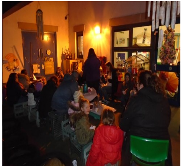
Parents and children enjoying a camp fire story session at Windmill Integrated Nursery Unit