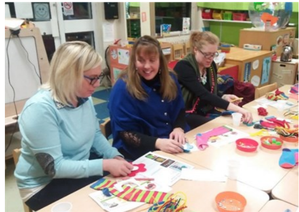
Parents at Denamona Pre-school exploring creative materials.

65% of settings across Northern Ireland are participating this year, engaging with parents to help them support their children's learning at home.