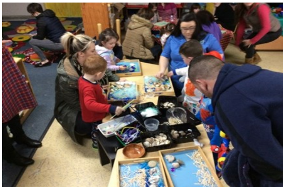
Parents at Cedar Integrated Nursery Unit finding out about the pre-school curriculum and how to help their children at home.

Last year settings provided a wide range of workshops and activities for parents; sharing information; demonstrating approaches and sign-posting to other services.