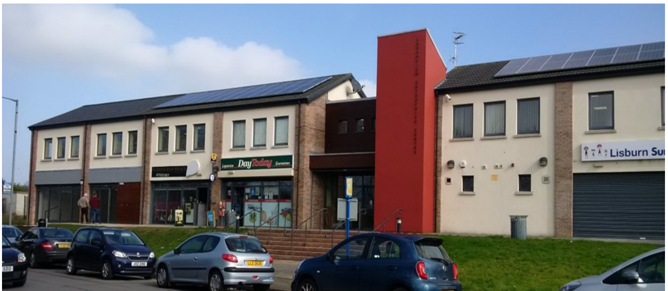
Laganview Enterprise extension

This investment has created a fit for purpose, local facility which is now delivering a suite of health and wellbeing services. It is offering counselling services, parenting programmes, early years and early intervention programmes as well as health advice for local families. The enhanced facility was greatly welcomed by the local community at the launch event.