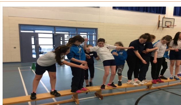
Team Building activity day for pupils from Nendrum College & St. Mary's High School

The relationships and levels of trust between pupils and teachers has increased as a result of these events thus strengthening the partnership.