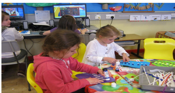
Pupils from St. Anthony's PS, Larne & Larne and Inver PS participating in a shared arts and ICT lesson as part of the SESP Programme.

New resources are being developed by teachers, through joint planning, that have supported shared activity. This opportunity to be innovative and creative has been embraced by teachers throughout the Project.