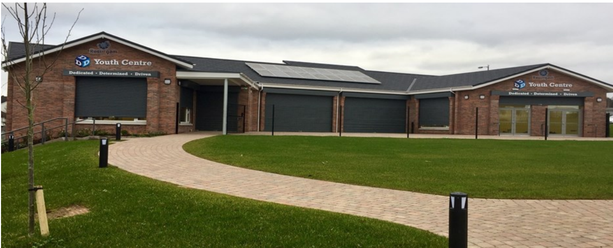
Resurgam Trust 3D Youth Centre

Also located in Old Warren, this dedicated youth facility has been built on the site of the former West Lisburn Community Centre. Originally built in the 1970s, it was no longer fit for purpose and through SIF has been transformed into a new, 375 sqm state of the Art youth centre.