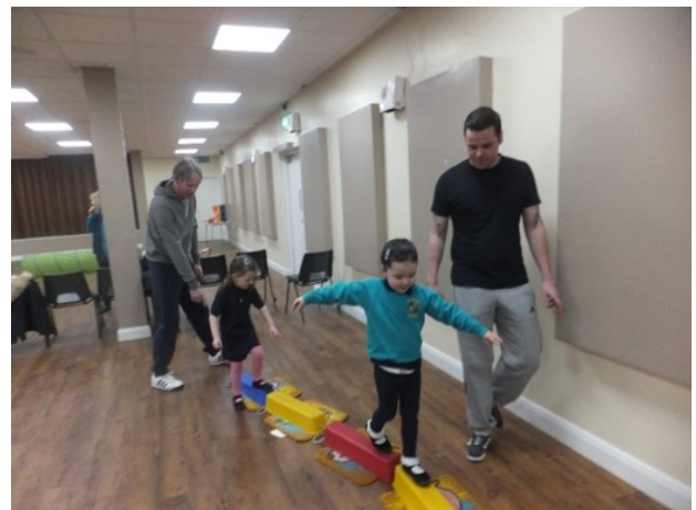
Dads at St Joseph's Community Playgroup learning how to develop physical skills and encourage active play.

Parents were encouraged to participate in events throughout the year and found out how to create better learning environments at home.