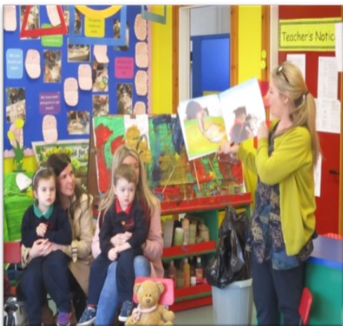
Parents and children enjoying a modelled story session at Cloughoge Nursery Unit

Development of a dedicated website, has provided an excellent forum for communicating with settings and encouraging sharing of practice. For Further information visit: www.gettingreadytolearn.co.uk