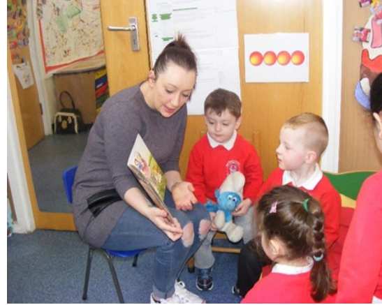
A mum reading to children at Holy Family Nursery Unit

“The parents are now more aware of what is expected developmentally. They are asking how to support their child and becoming enthused to find out they already have all the resources they need.”